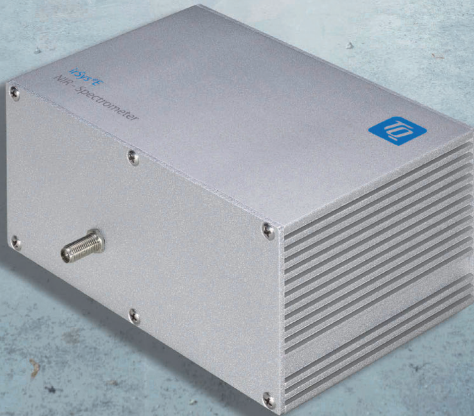
irSys ® E Spectrometer