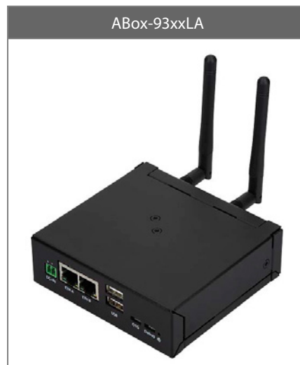
Table 2: ABox-93xxLA Chassis Option

Currently the ABox-93xxLA is available in single configuration. The following table shows the details: